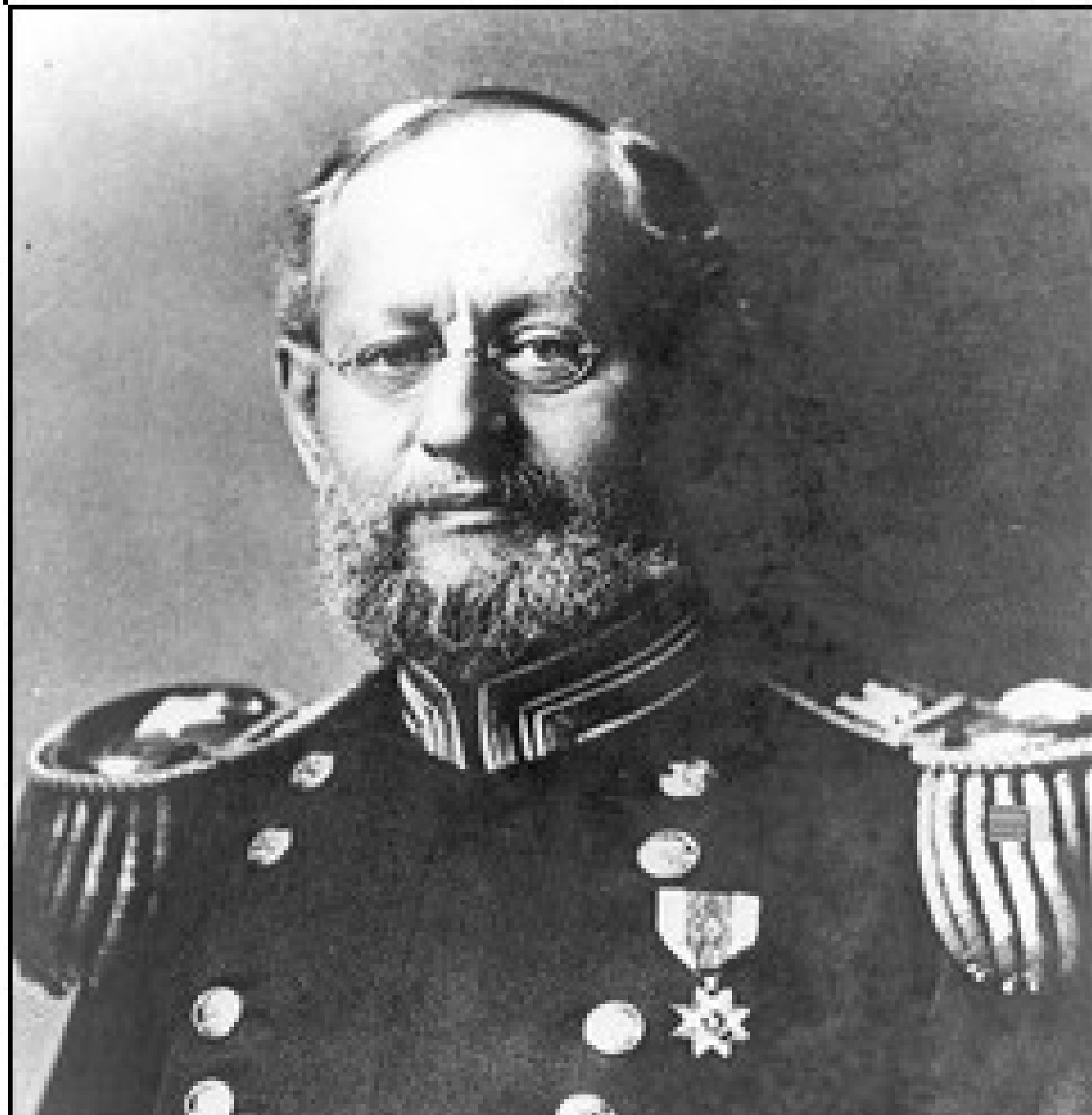
Brigadier General Henry Martyn Robert