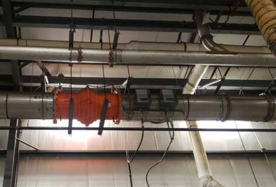
LEFT: Vidimos installs fume collection systems like these for industrial clients in Indiana.

for Vidimos, giving the company the experience it needed to build trust with these clients.