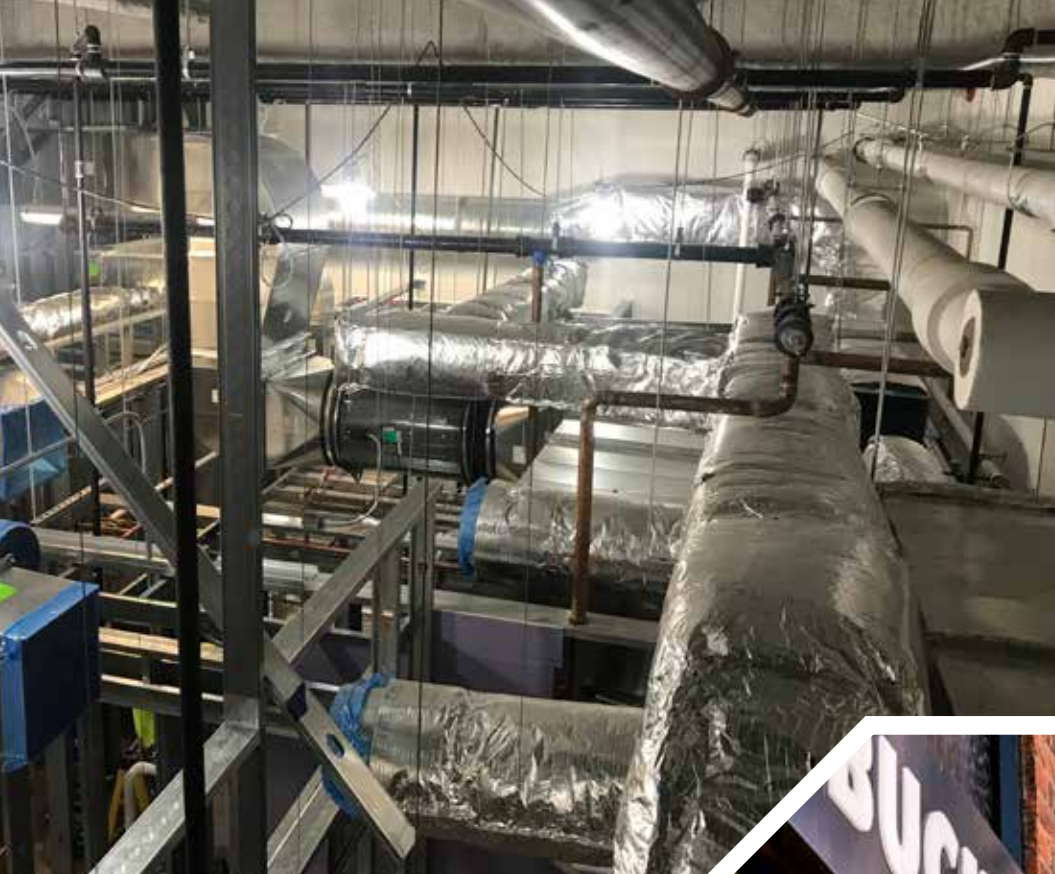
LEFT: Artlip and Sons installed insulated duct and an inline fan above the acoustical ceiling for a Starbucks located inside a Chicago high rise.