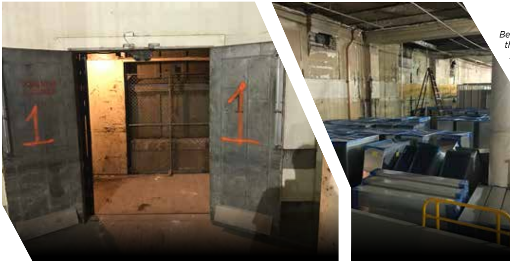
Because of logistical difficulties with the more than 100-year-old building, most of the 20,000 pounds of the metal used in the project had to be prefabricated and moved through the building's original elevators.