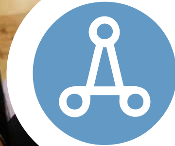
American Institute of Architecture Students