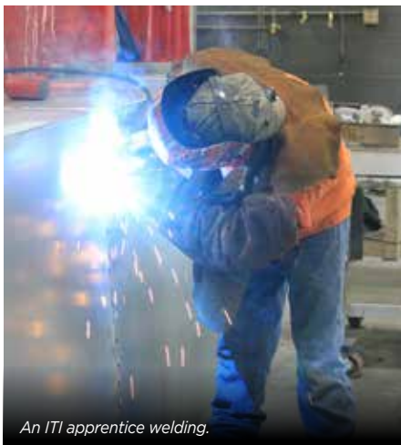
An ITI apprentice welding.

"One of our instructors led the sheet metal part of the program — a couple of nights' overview of what a sheet metal worker does, what kind of tools we use, and what kind of equipment is used on the job," he said. "We took them out and walked them through a basic shop project so they had something they could take home."