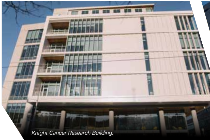
Knight Cancer Research Building.