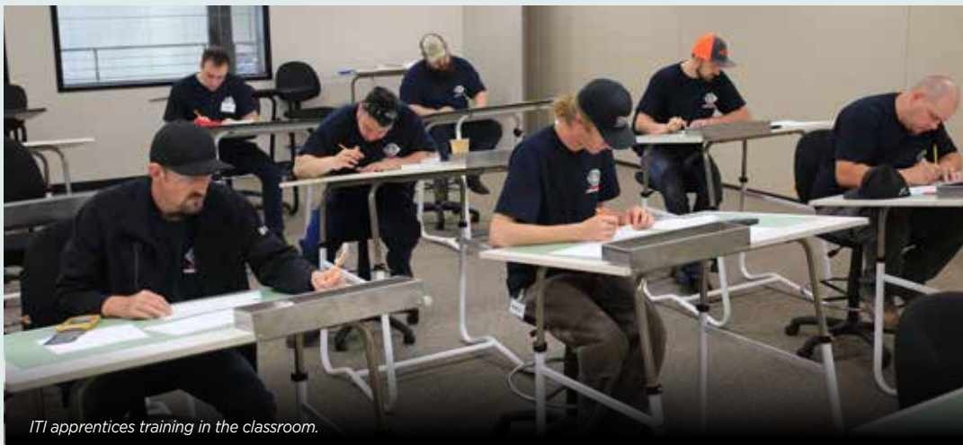
ITI apprentices training in the classroom.

SMACNA members are encouraged to educate their new members of Congress about this and other legislation that supports the industry. Members may contact them through SMACNA’s Take Action web page www.smacna.org/advocacy/take-action .