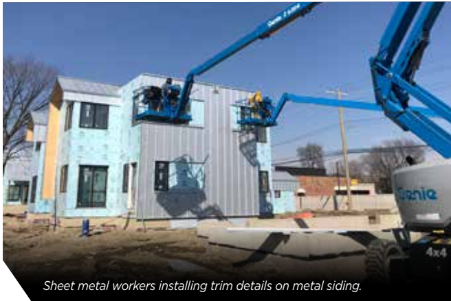
Sheet metal workers installing trim details on metal siding.