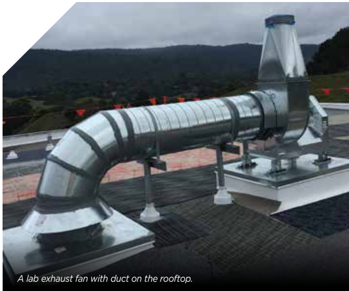
A lab exhaust fan with duct on the rooftop.